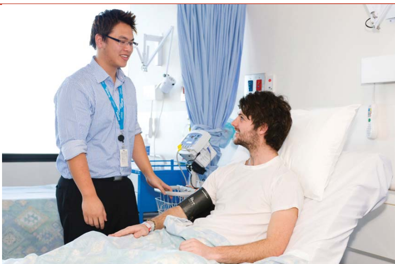
A healthy volunteer is monitored during a Phase 1 study.

Phase 1 clinical trials, where a new drug therapy is tested in a healthy volunteer or in patients with specific medical conditions, are integral in the development of new therapies. Nucleus Network relies on community involvement in this process, and is grateful for the time and effort volunteered by participants, without whom new medicines would not reach the people who need them most. The information collected from clinical trials monitors and protects the participants' health and also provides crucial information about the therapy under trial.